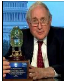
2014 Beacon Award Winner